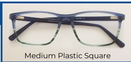
Medium Plastic Square