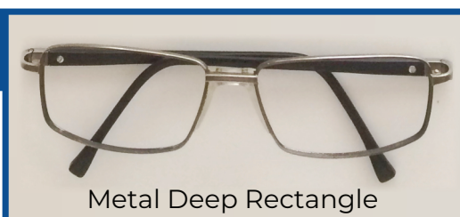
Metal Deep Rectangle